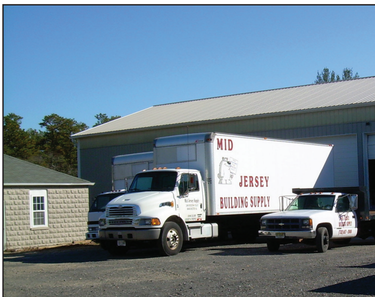
Mid Jersey Building Supply offers free delivery.