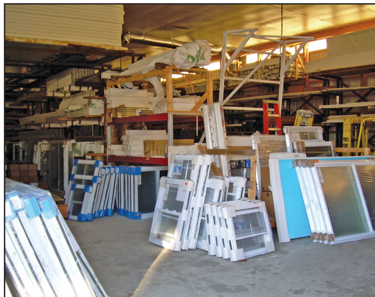
The warehouse boasts many different products for customers.