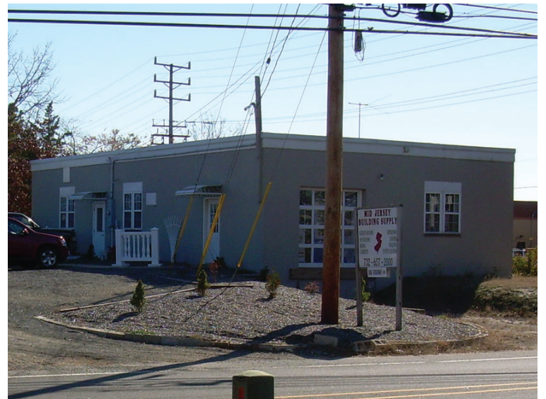
Mid Jersey Building Supply's showroom is located at 2486 Ridgeway Boulevard in Manchester.